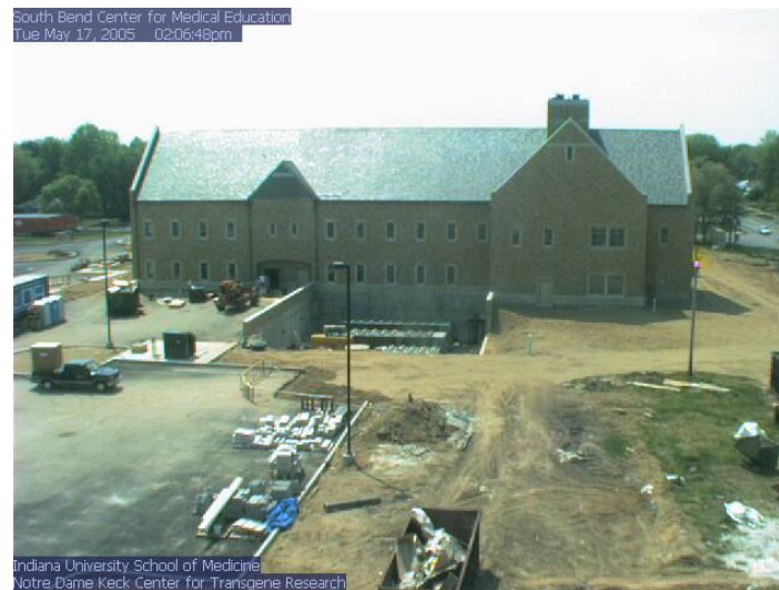
IUSM – South Bend