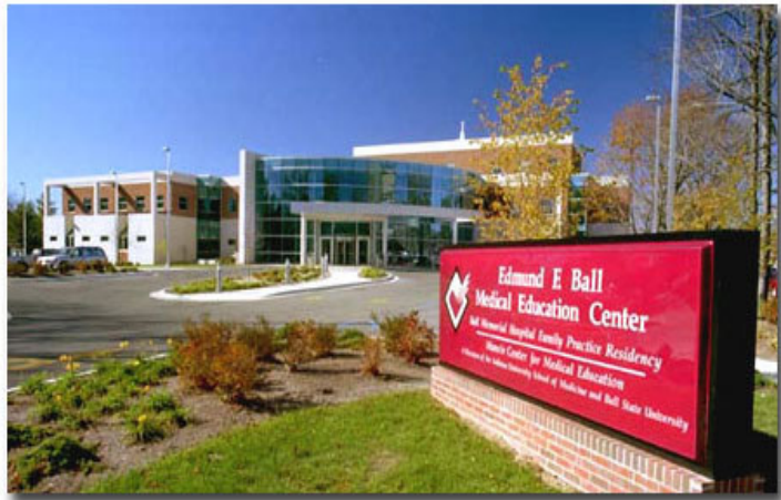
IUSM – Muncie