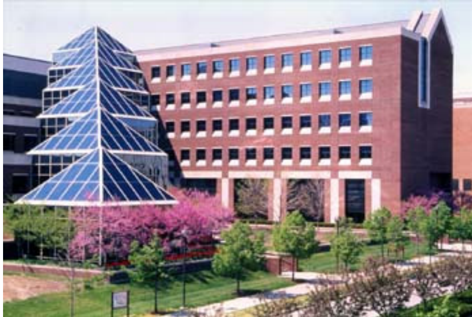
IUSM Ruth Lilly Medical Library