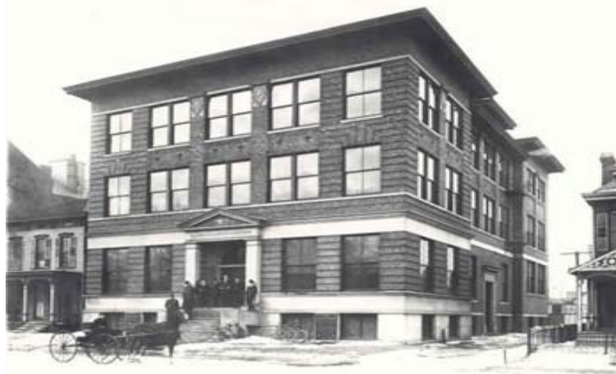
School of Medicine Building 1906 Senate Ave. - Indianapolis