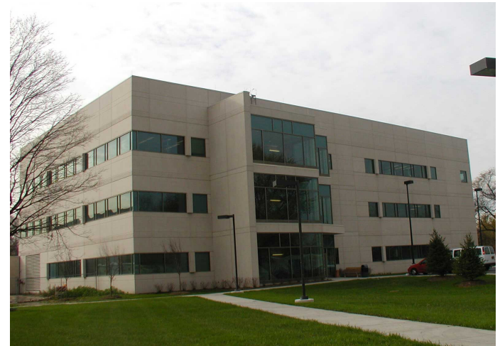
IUSM – Gary